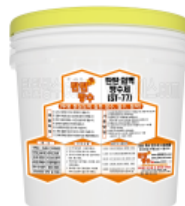
TanTan Outer Wall