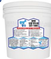
TanTan Insulation Waterproof Agent