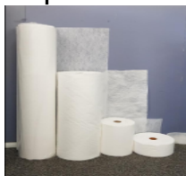
TanTan Reinforcing Fabric