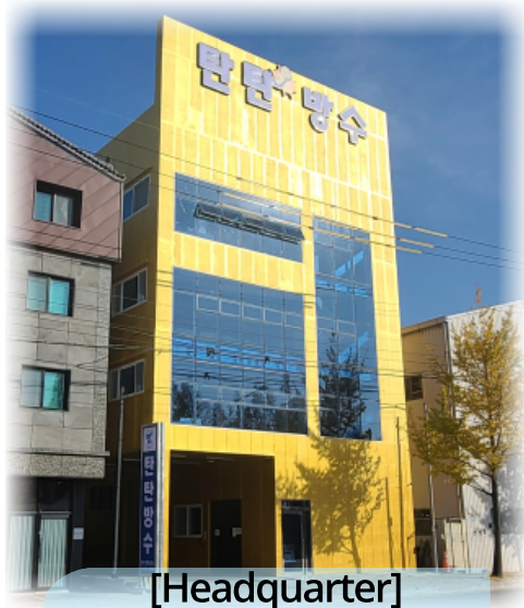
[Headquarter] Waterproof exhibition hall

TANTAN NICE specializes in manufacturing and selling greatly effective waterproof agents.