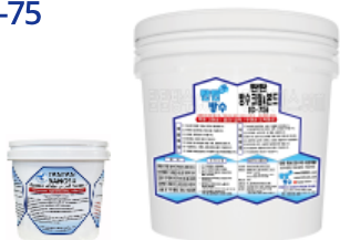
TanTan Waterproof Cream