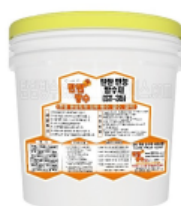
TanTan Versatile Waterproof Agent