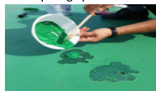
Mix with sand

< Repairing a place where there's a height difference and lifting. >