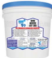
TanTan Plaster Tan