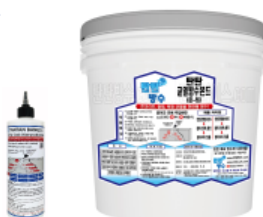
TanTan Crack waterproof Bond