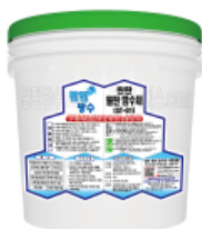
TanTan OneTan Waterproof Agent