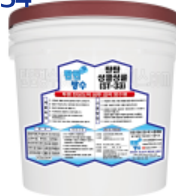
TanTan Shingle Shingle